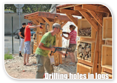
as part of the eco-volunteer days

It would not have been possible to fill all of the bee hotels on the 16 URBANBEES sites without the active participation of our team of eco-volunteers. A total of 50 eco-volunteer days were organized, with the time divided up between cutting stems and drilling holes in the logs, with a bit of rest time set aside for going on a walk to discover wild bees. ARTHROPOLOGIA team members were on site to share their knowledge and expertise in exchange for the time and energy offered by the eco-volunteers.