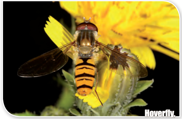
a fly that mimics hymenopterans

The 2,000 different bee species that are found in Europe are classified into 6 families – Melittidae, Andrenidae, Halictidae, Apidae, Megachilidae, and Colletidae – and further divided into genera, which are primarily distinguished by the length of their TONGUE , the shape and size of the cells on their wings, or, in the case of females, the position of the pollen gathering structures.