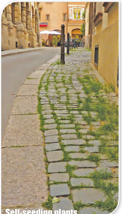
Self-seeding plants City of Montpellier