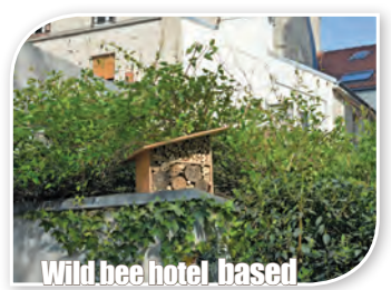
on the models available for download on the URBANBEES website

Starting the ball rolling by putting theory into practice and urging people to take action (eco-volunteer days, nest-building workshops).