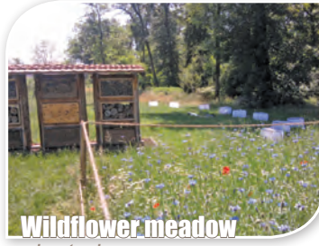
planted near urbanbees installations