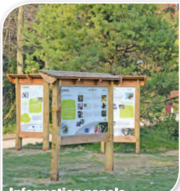
Information panels put up on the urbanbees site in the Parc de la Tête d'Or - Lyon