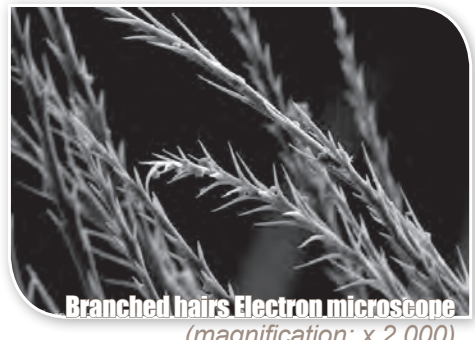
(magnification: x 2,000)

Yet nearly all bees stand out from a number of their cousins thanks to their herbivorous diet. Adults and larvae feed exclusively on pollen and nectar. In most cases, the females are equipped with an apparatus designed specifically for gathering and carrying pollen. But the unique character that identifies them is that all bees have ramified bristles called 'branched hairs' that help them collect pollen in their hair coat, but these are only visible at high magnification.