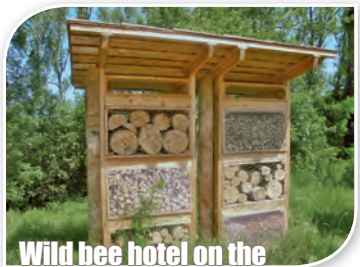
URBANBEES site in the Parc Feyssine - Villeurbanne

Bee hotels are large, wooden structures fitted out with cavities that are especially designed to serve as nesting sites for certain wild bee species. To cater to the ecological needs of a wide range of species, the separate hotel compartments are filled with either logs pierced