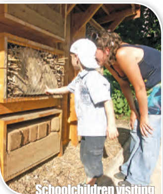
URBANBEES installations as part of a school awareness raising event

All of the children came out of these workshops armed with enough knowledge and tools to be able to play a significant role in the drive towards protecting wild bees and biodiversity. They were encouraged to continue pursuing their projects, and to bring their families along to take part in other URBANBEES events and initiatives.